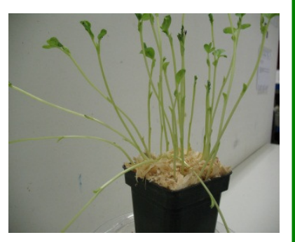
Fig. 2: Vicia sp. shouts in pots covered with wood chips